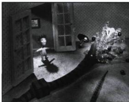
Tim Burton's The Nightmare Before Christmas