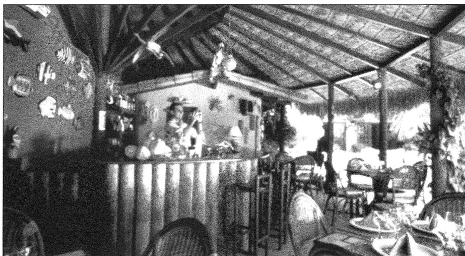
Manary Praia Hotel, Brazil.

Although the protection of marine areas has lagged behind terrestrial areas, that tourism product is strong and growing. Marine ecotourism emerged from simple