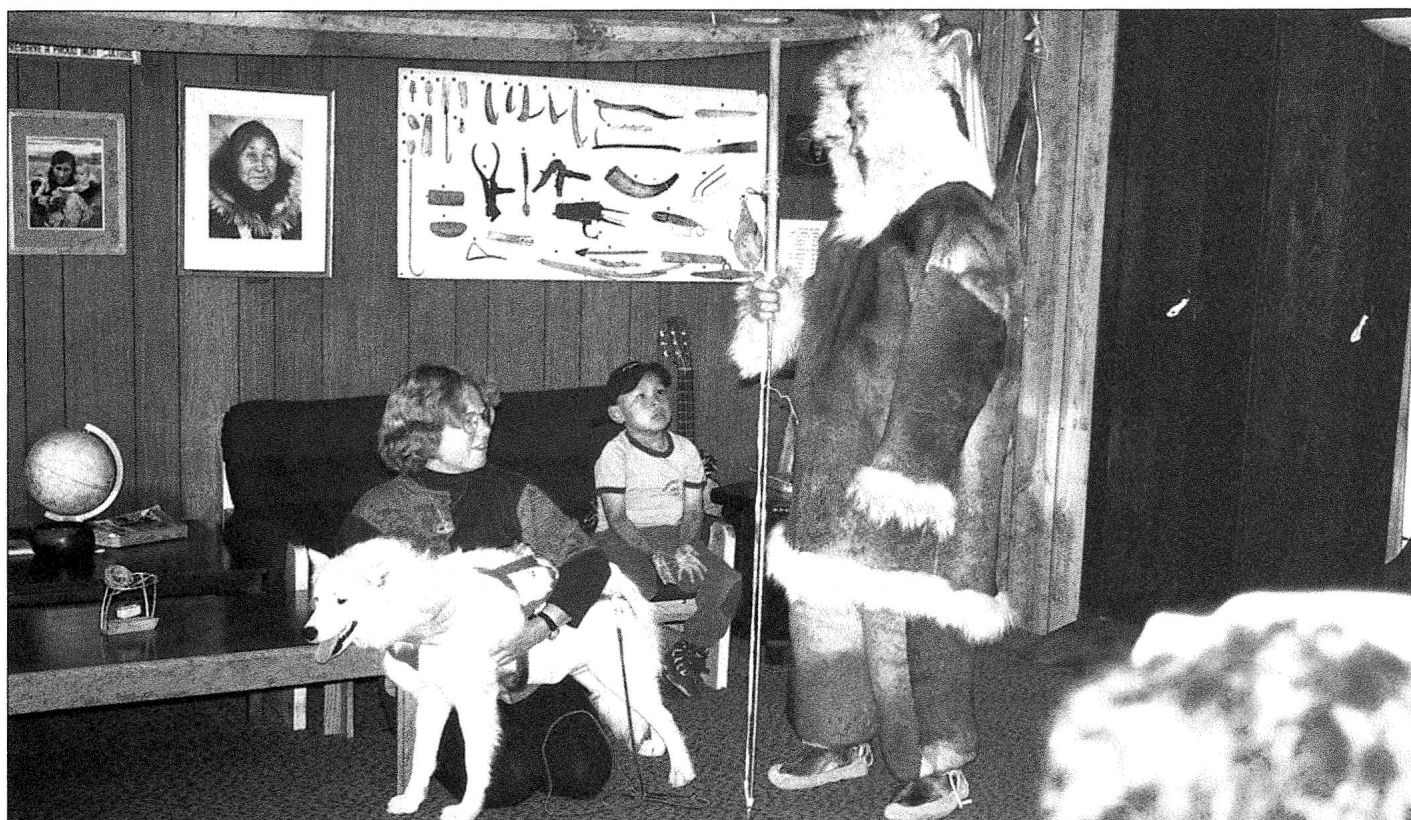
Cultural Program, Bathurst Lodge (Canada).

World Tourism Organisation found that only half the Canadian operators who offer ecotourism products use the word “ecotourism” in marketing, although their ecotourism markets are growing (Pam Wight & Ass., 2002). Operators essentially feel that there is a lot of confusion in the marketplace and among operators about definitions. Some provinces, too, are reluctant to use the term ecotourism, preferring “soft adventure.”