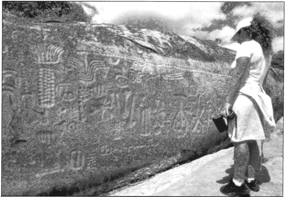
Inga Prehistoric Rock Art, Brazil.

The USA is a popular destination for many travellers. However, tourism tends to follow the mass tourism template. It is viewed less for ecotourism, than offering adventure or nature-based products. Alaska is its preeminent adventure destination, and of course the entire Rocky Mountain chain provides an attractive destination for many types of nature/adventure activities, with key destinations being Colorado, as well as the Grand Canyon and Wyoming. According to the Director of the Institute for Ecological Tourism at Humboldt State