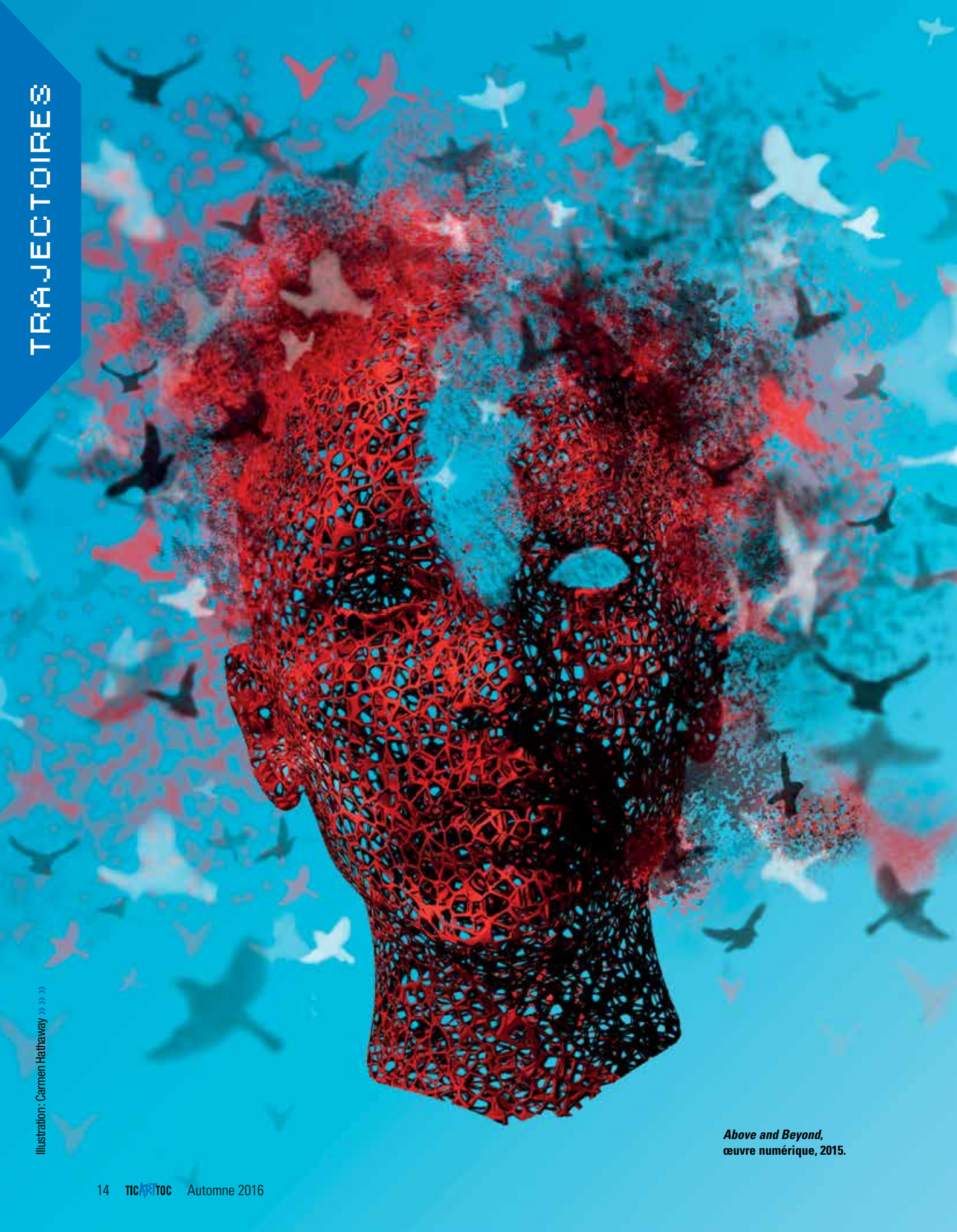
Above and Beyond, œuvre numérique, 2015.