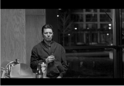
Column 2: German subtitles