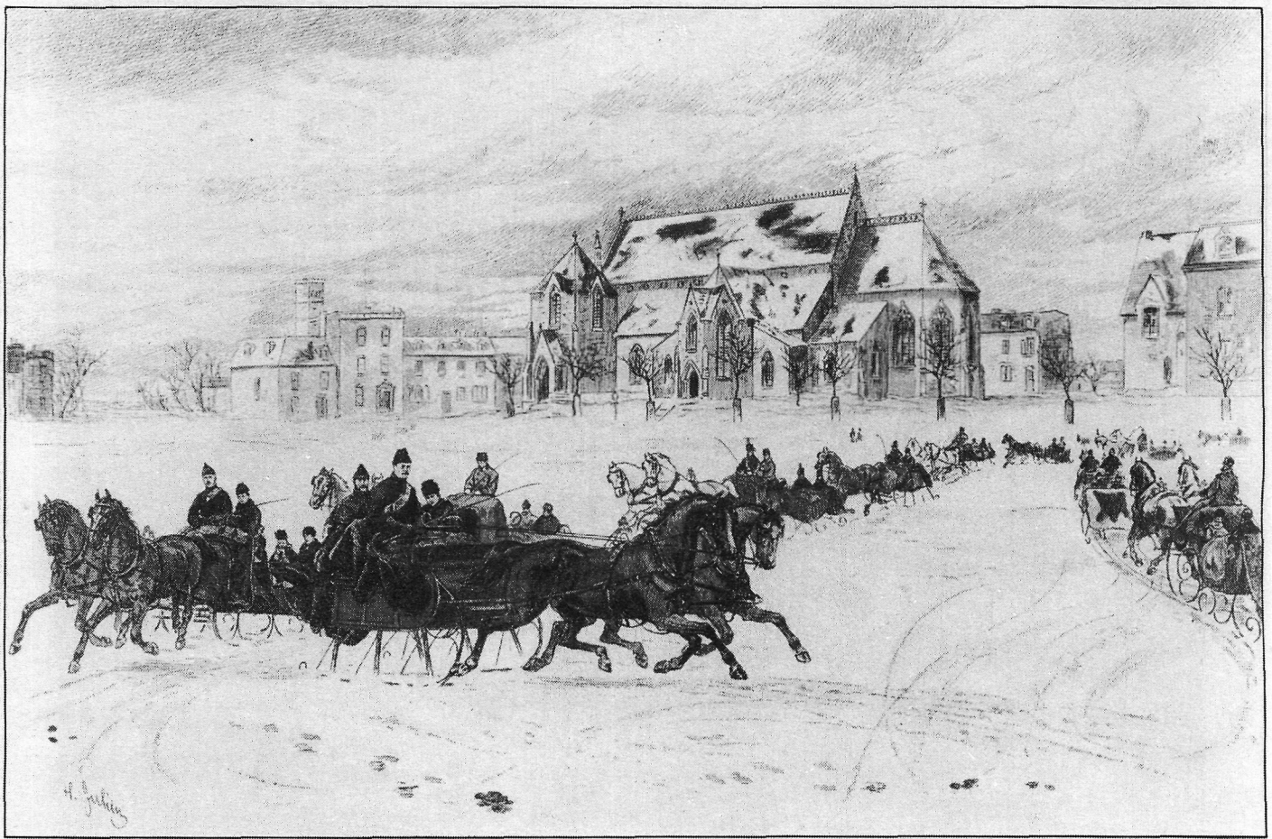
MONTREAL:—MILITARY DRIVE OF THE OFFICERS OF THE "1st PRINCE OF WALES REGIMENT."

The apparent preference of Grand Trunk Railway clerks, after the disbandment of their own militia units in 1881, for the Royal Scots (who took the Grand Trunk Railway's entire 23 man band on strength) 35 and the Canadian Pacific Railway's clerks (including the Railway's influential Chief Clerk) for the Victoria Rifles, fortifies the notion of the tie between the work place and the parade