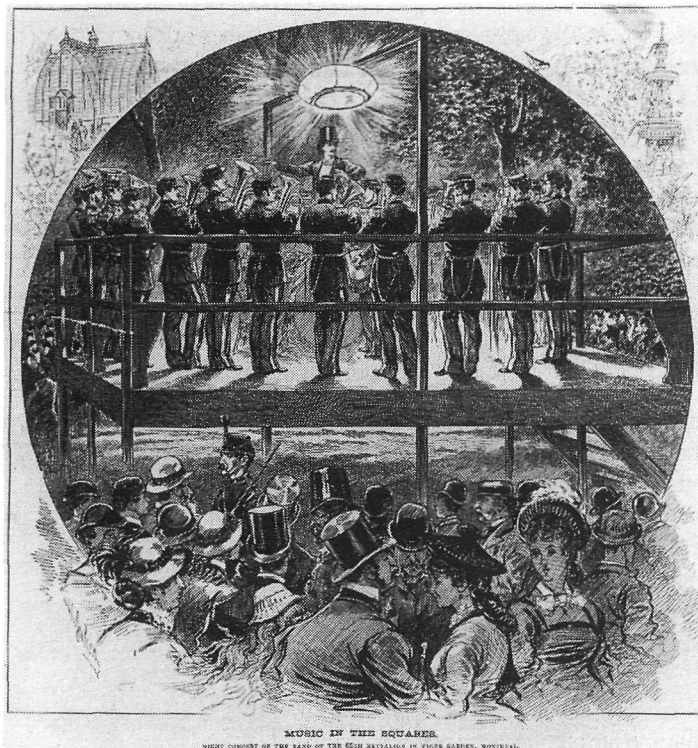
Band concerts, such as the one depicted by Henri Julien's line drawing, served a similar function and provided good public relations. Canadian Illustrated News, 18 September 1880.

those offered by the Montreal Amateur Athletic Association, were increasingly beyond the means of low paid, young, white collar workers. Whereas an active annual membership in the M.A.A.A. cost 10 dollars in 1881, by 1907 it had risen to 15 dollars. Prospective members faced long waiting lists and an additional ten dollar entrance fee. 28 In contrast, membership in the militia was free.