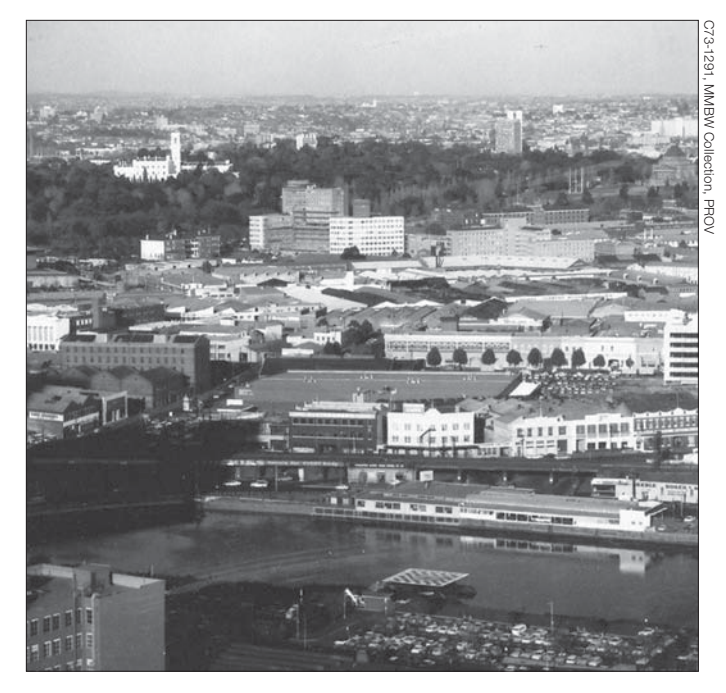
FIGURE 1 : South bank of the Yarra River, Melbourne, ca. 1973.

years in opposition. Its response to these problems was to diversify the urban economy away from its historical reliance on manufacturing employment towards an emphasis on tourism, leisure, and spectacle. Almost immediately new economic policies were announced that explicitly recognized the role that Melbourne as a major sporting and cultural city would play in the new post-industrial economy of the 1980s and beyond. While previous governments had tentatively explored the role of these things in driving economic growth, the Cain government's "economic initiatives" statement of 1984 overtly declared that the "national role of Melbourne as a major trading, cultural and sporting centre," was one of Victoria's "competitive strengths" that could and should be harnessed for economic purposes. Capturing and capitalizing on the growing financial importance of professional sport was to be an important component of future economic growth. Doing so, it was suggested, could have unexpected spinoffs for activities and industries beyond the purely sporting: