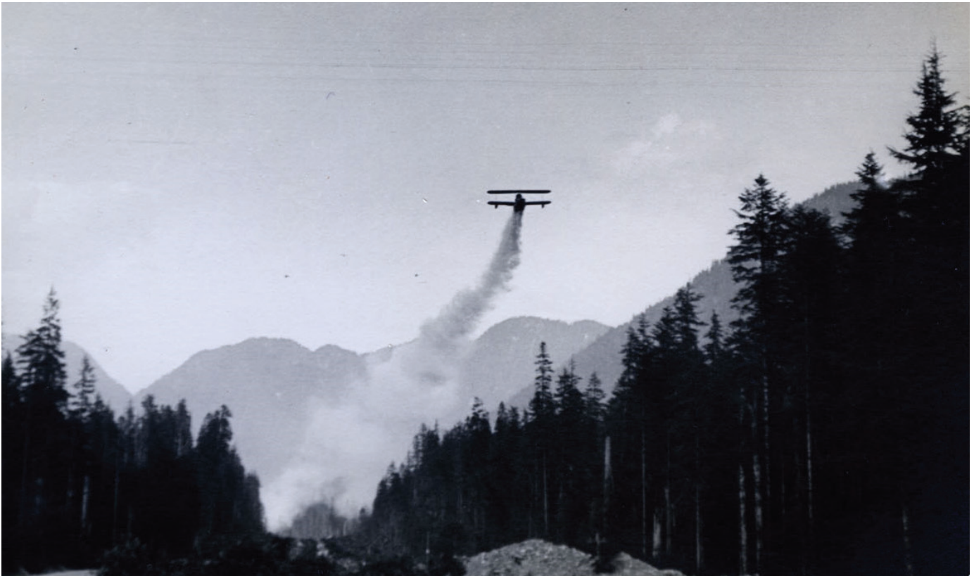
Figure 4: Although few photographs of the aerial dusting of the Seymour River survive, this rare image captures one of the aircraft as it drops its payload of toxic calcium arsenate over the looper-infested hemlock (Courtesy of Natural Resources Canada).

pointed to it moving swiftly down the canyon that season. Although this area was below the intake on the Seymour watershed (i.e., erosion would not be an issue), Hopping stressed that the hemlock in this area were in danger of dying. If they did, it would create a fire hazard for the 60-inch wooden conduit that ran from the dam's intake to the distribution mains lower down the mountain. Hopping added that the area, despite its steep slopes, could be dusted by plane and he practically guaranteed that doing so would "save the timber." 72 Cleveland thanked Hopping for framing the issue in these terms—depicting human intervention as all that was needed to preserve the hemlock in the Seymour valley. Doing so provided Cleveland with just the fodder he needed. He relayed Hopping's views to the board at a meeting in mid-May, during which the board authorized him to deal with this looper infestation "in the way that to him seems best under all the circumstances." 73 Within a few weeks, Cleveland had negotiated a contract with a private airplane firm and purchased enough dust to carry out the mission. The board agreed to cover its $6,000 cost. 74