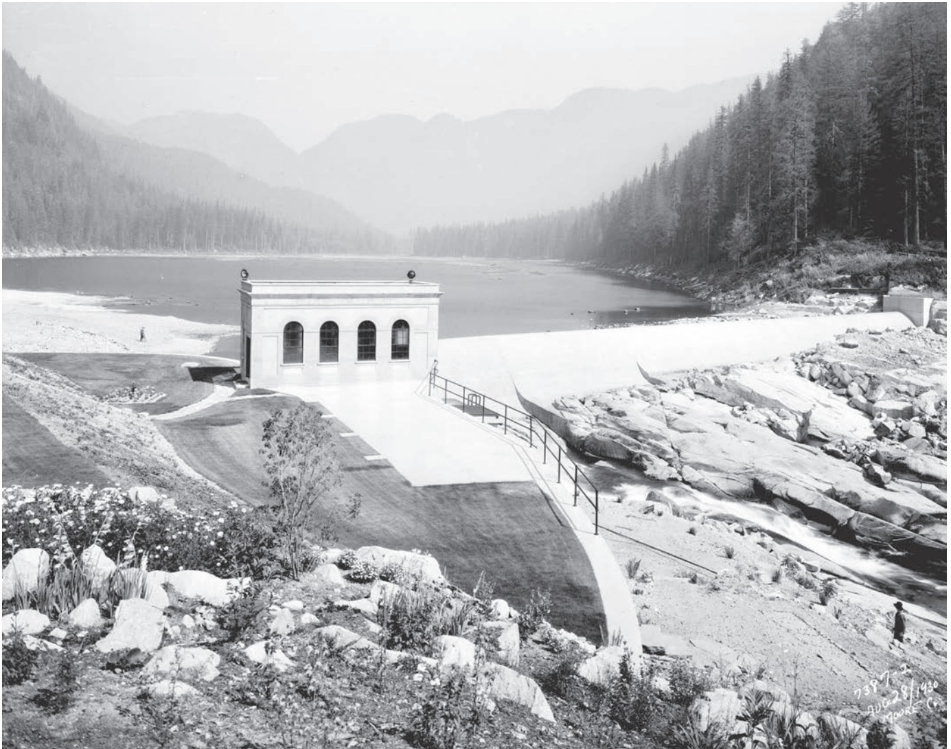
Figure 3: The dam at Seymour Falls was completed in 1926 and was crucial to transforming the river from being a natural waterbody with seasonal highs and lows into a reservoir tank that could be controlled to supply Vancouver with water. The building contained the screen house, through which the water passed before it was sent through a 60-inch, wooden conduit roughly four miles down the mountain to the city's distribution mains. The local grounds were also landscaped to improve their aesthetic appeal.