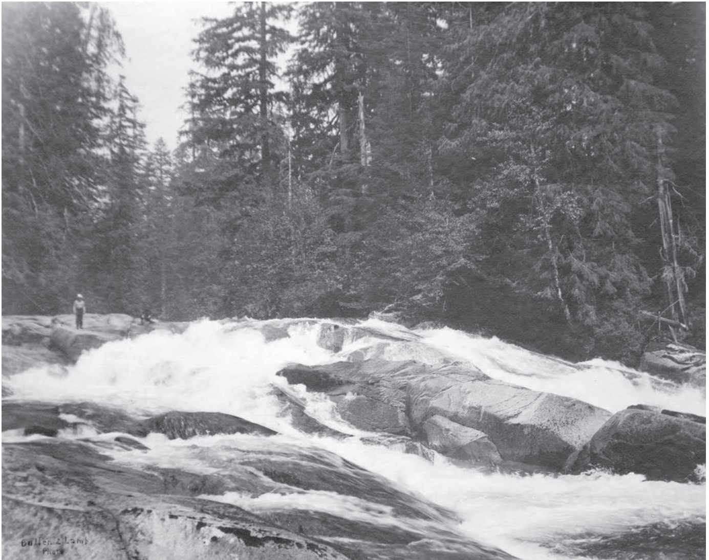
Figure 2: Seymour Falls represented all that was sublime about the watersheds from which Vancouver drew its water.

deep rocky canyons, and along shores as yet uncontaminated by the impurities which follow in the wake of settlement.” 27