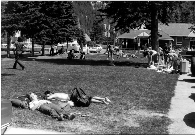
Figure 3. Relaxing on the grass at Central Park in the early 1970s. Rundle Memorial United Church can be glimpsed at top left, through the trees and across Banff Avenue.

1960s. Visitation rose from 12,000 in 1967 to 14,000 in 1968 and then 21,000 in 1969. The percentage of Cellarites who were neither employed in Banff nor attending the BSFA doubled from less than 10 per cent in 1966 to about 20 per cent in 1969. 63