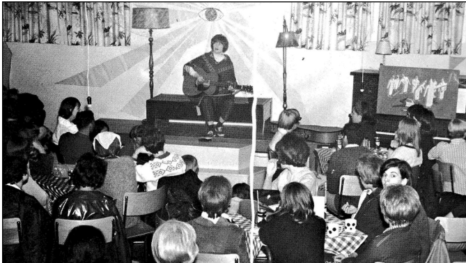
Figure 2. The Unsquare Cellar in summer 1965.

with direct access from Banff Avenue. It was established by Reverend John Travis and student ministers in town for the summer, with the intention of keeping youths “off the streets and occupied during the dangerously boring long summer evenings.” 39 Young people of all denominations and backgrounds were welcome, though the Cellar was intended primarily for young workers who needed “a break from ... headwaiters, managers, and landlords.” 40 It was patterned on the coffeehouse ministries that were popular on college campuses and also features of the counterculture scene in places like Yorkville. 41 There was no proselytizing: the Cellar epitomized the United Church’s 1960s mandates of direct social action and seeking cultural relevance by listening to “outsiders.” 42