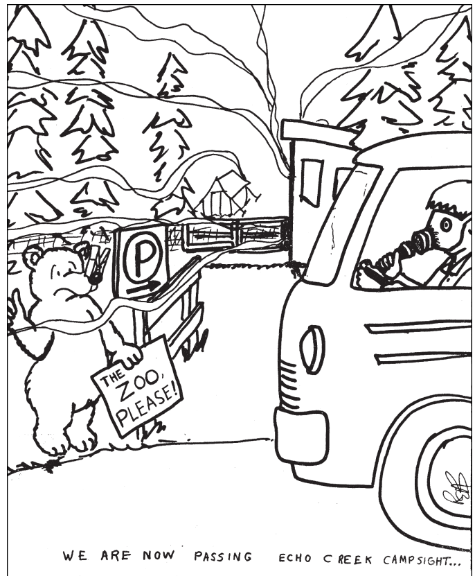
Figure 5. The end of Echo Creek campground, as depicted in the Crag and Canyon , 1 September 1971.

“Now you see ‘em, now you don’t” is how DG recalled of the contrast between the summers of 1971 and 1972. “Word must’ve got out: the scene is over.” 117 While counterculture scenes were dissipating in cities and towns all around Canada in the early 1970s, the intensely seasonal nature of Banff’s made its passing quite conspicuous—at least to permanent residents. 118 Panhandling disappeared. Shoplifting plummeted. Drugs were not openly used in public spaces. The Banff Advisory Council found that “everything seemed under control [with] no large scale complaints around town.” 119 New problems would emerge, but even noisy motorcycles and