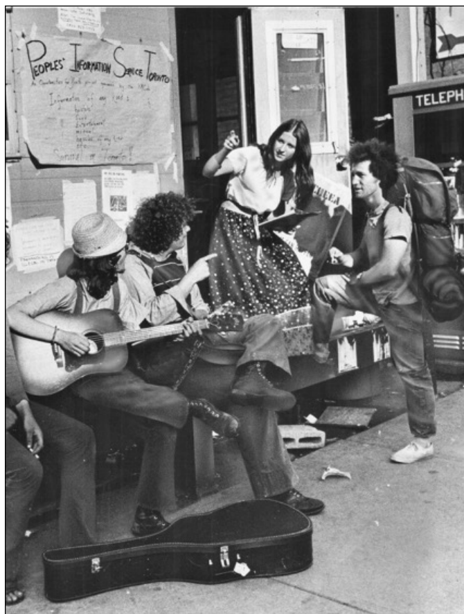
Figure 5. The Yonge Street mall was a meeting place and point of entry into the city for transient youth. Here a hitchhiker from Newfoundland speaks with a worker at the People's Information Service trailer just off Yonge Street in summer 1971.

It is difficult to determine who exactly these young people were, but a significant number were not locals. During the early 1970s Toronto was a hub for the tens of thousands of youth crisscrossing the country or the continent on their way to and from school or work, or simply in search of adventure and experience through mobility. 63 These “transient youth”—as they were labelled by a 1969 national inquiry—naturally gravitated towards the Yonge Street pedestrian mall's central location in search of food, excitement, a bed, friends, jobs information, or even medical attention. Certain spaces on the mall became informal gathering points, including a long landscaped lawn near Yonge and Queen that one teenager referred to as “a meeting place for