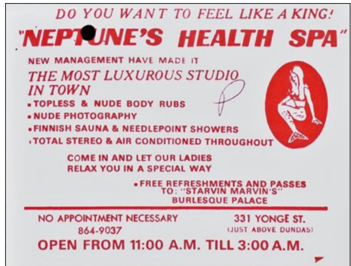
Figure 4. Coupons and handbills for Yonge Street's nude body rub parlours were handed out daily on the mall. This one, from 1973, is typical in its use of suggestive language and the nude female form to attract clients.

Conspicuous by its absence, the automobile also played an important role in defining the Yonge Street mall. When Toronto City Council took over planning of a downtown pedestrianization experiment from environmentalists GASP and Pollution Probe in 1970, it was quick to set the new initiative apart from the failed Leave the Car at Home Week. The Yonge Street mall, the city emphasized, was not an "experiment in pollution control," nor was it anti-car; it was about bringing people, and life, back downtown. 55 But in the charged political context of the early 1970s, it was impossible to exclude larger urban debates from the newly created public space. After all, wasn't the very idea of pedestrian malls a product of ambivalence over the impact of cars on the city? Local newspaper coverage tended to exploit the contrast between the mall and ordinary downtown streets, offering articles that treated the closure as a potential nightmare for drivers—"chaotic traffic jams"—alongside pieces exclaiming