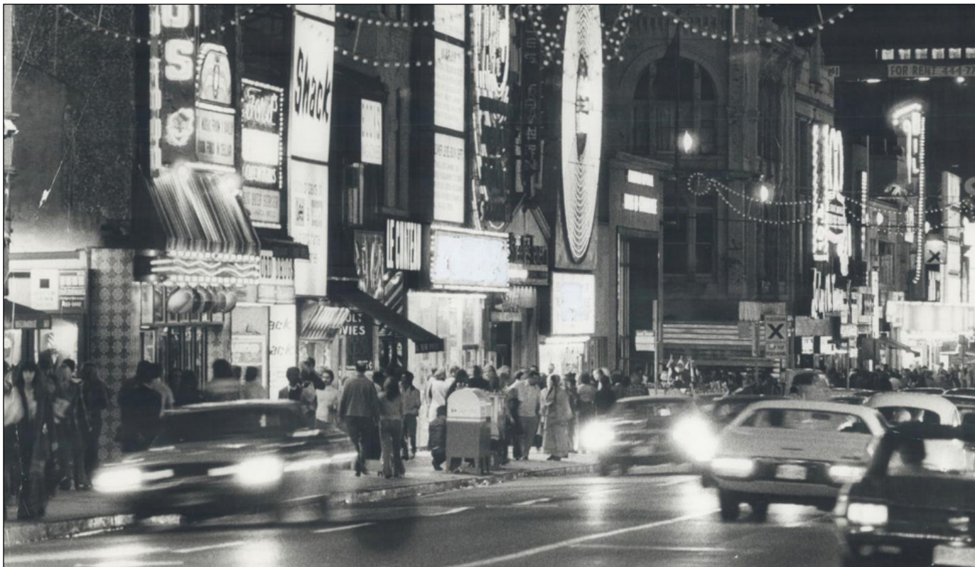
Figure 1. The Yonge Street Strip, looking south from above Gould Street, 1973

the larger urban transformations facilitated by the automobile, communities across North America redesigned downtown spaces around people. By the late 1970s, what some urban observers referred to as “the pedestrian revolution” was in full swing: a dozen Canadian cities and more than 200 in the United States had closed one or more downtown shopping streets to automobiles. 3 Scholars who have studied these projects have focused most of all on their failure as an economic revitalization strategy. 4 Pioneering pedestrian streets like the Kalamazoo Mall, opened in 1959, were held up as symbols of hope for downtown retailers beset by postwar decentralization and deindustrialization, an inexpensive urban intervention that would allow struggling Main Streets to challenge the ascendant shopping mall and “beat suburbia at its own game.” 5 However, the promised economic benefits of pedestrianization seldom materialized. In cities that had staked their downtown future on car-free streets, initial successes gave way to renewed reports of decline. Ultimately, low-cost, largely aesthetic solutions like pedestrianization did not—could not—address the larger economic problems that beset many North American downtowns in the second half of the twentieth century. 6 As few as one in ten pedestrian malls in Canada and the United States have survived into the twenty-first century. 7