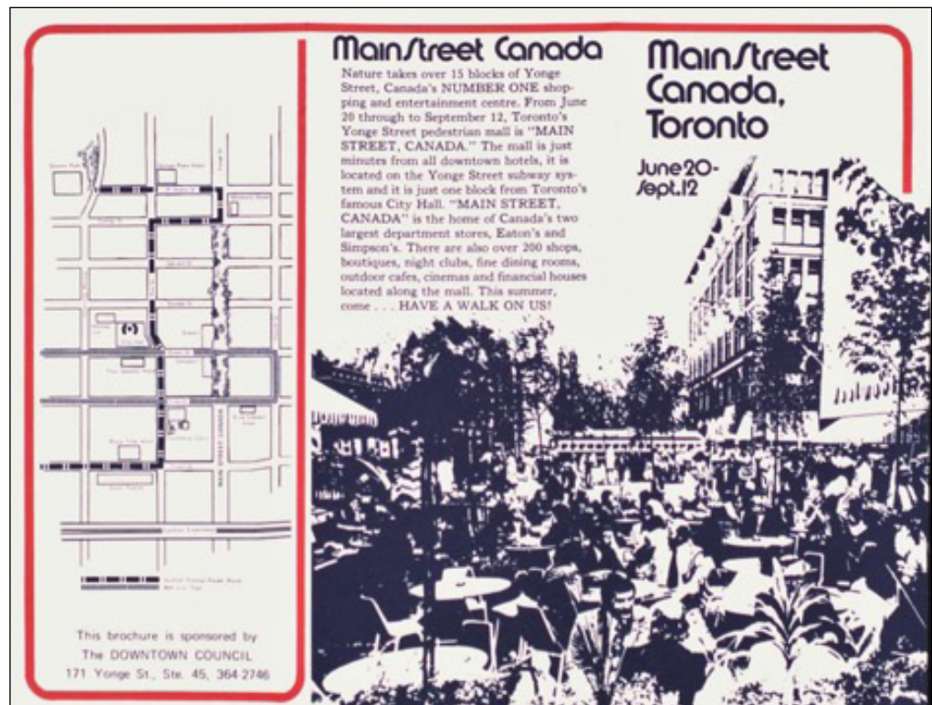
Figure 3. A promotional brochure prepared by the Downtown Council merchants' group, portraying the Yonge Street pedestrian mall as "Main Street Canada," 1973.

More importantly, merchants' dreams of competing with shopping centres for suburban customers also seemed to be coming true. According to that same 1974 study, one mall-goer in three came from the city's five suburban boroughs; another survey conducted in the inner suburb of North Toronto in 1973 found that three in four respondents had visited Yonge Street during that summer's closure. 41 Early on, small business owners glowed that the mall was "attracting people who haven't been downtown for [years]," and nearly all the businesses participating in the experiment reported increased foot traffic and sales