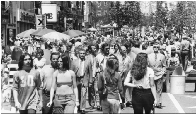
Figure 2. Crowds on the Yonge Street pedestrian mall, summer 1972.

postwar era. Yonge's independent merchants were one group who did not benefit from what was otherwise a period of growth and investment in downtown Toronto. 17 Calls for a pedestrian mall as a means to attract middle-class suburban shoppers downtown were the latest in a series of attempts to enlist the city's aid in pushing back against rising rents, decentralization of the population, and the aggressive business tactics of the department store giants. Like earlier lobbying, the initiative was met with sympathy from city staff and elected officials, but no concrete action. 18