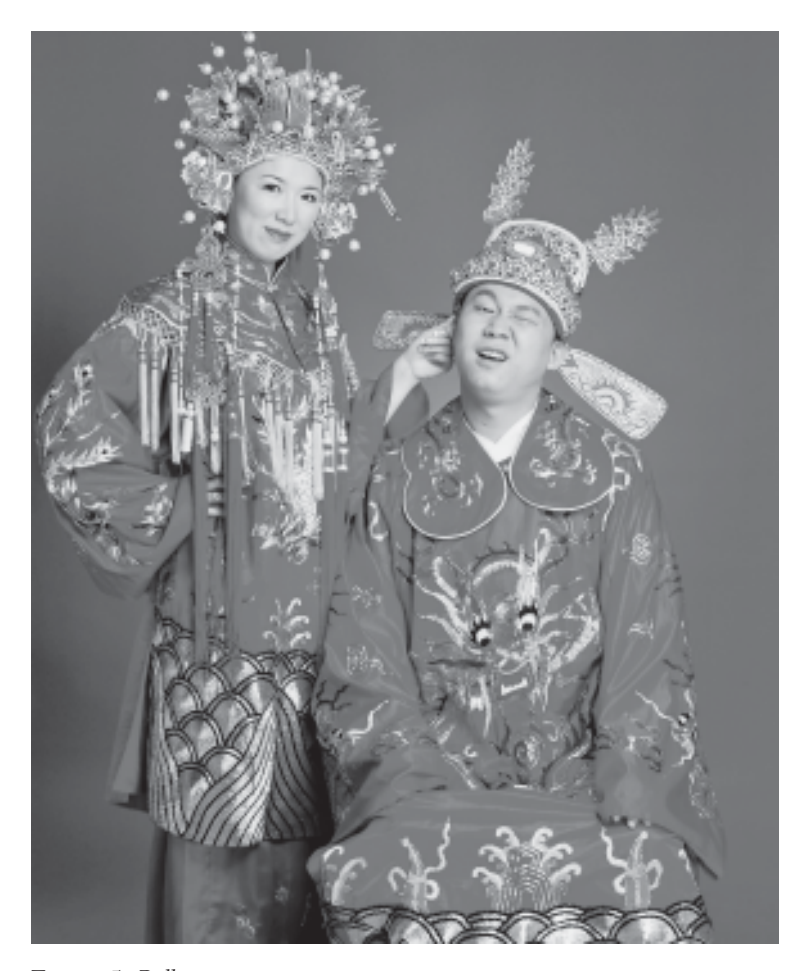
Figure 5. Pulling ear

gender genealogy and constitutes an important element in Cynthia's personal gender project. It conveys non-submission as not only acceptable but also attractive.