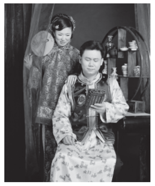
Figure 2. Late imperial time