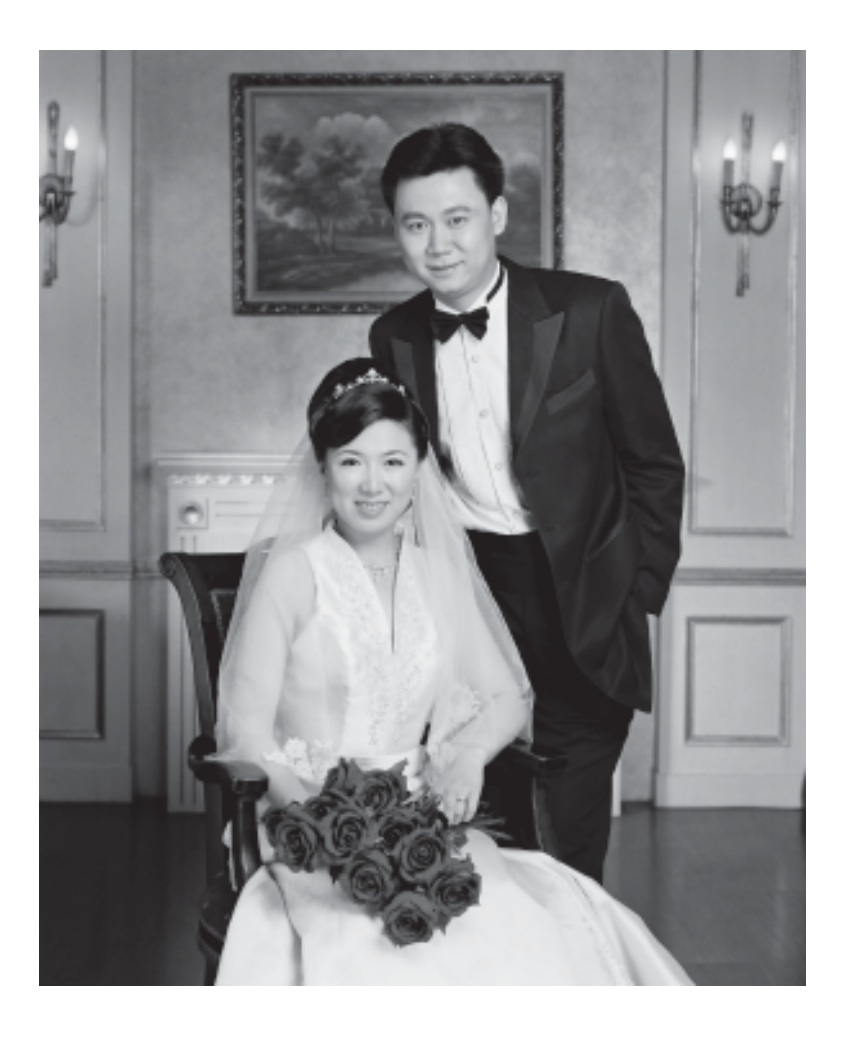
Figure 4. Modern times

wedding photos are chosen by design and function as cultural markers. They constitute one layer of gender-signifying practice — the settings for gender acts. Another layer of the gender script emerges from the performers' bodily postures, movements, and interactions with each other. They work together to enact the script and put this gender drama into play.