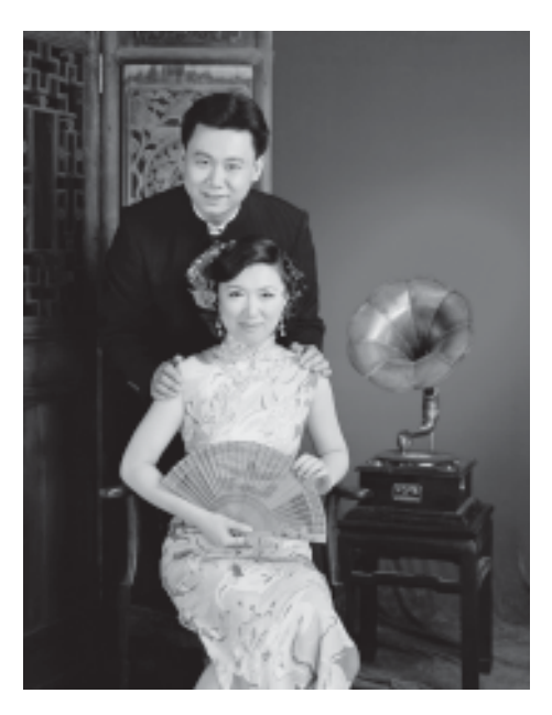
Figure 3. Republican era.

The bamboo products and carved sandalwood fan indicate the south of China, while the phonograph reveals the popular Westernized culture associated with urban areas, particularly the treaty port cities.