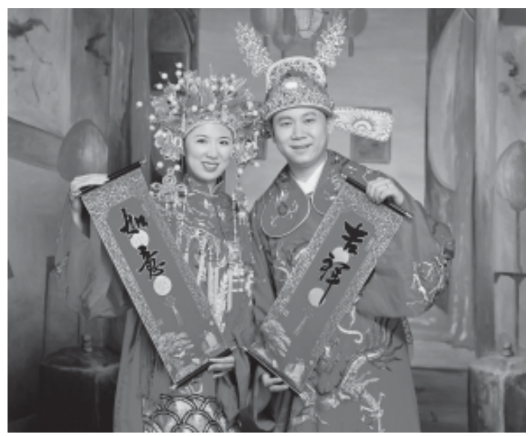
Figure 1. Traditional China.