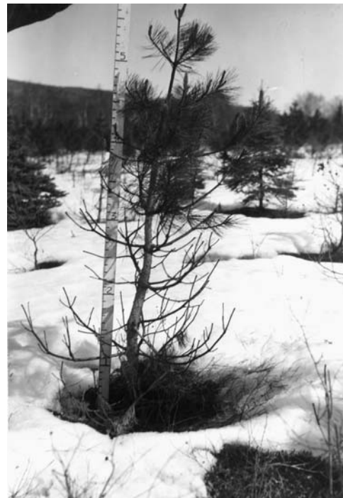
Figure 1. "All the lower branches up to three, four, or five feet on living red pine bore dead terminal shoots and later were completely defoliated". Page 5 in Pomerleau and Ray (1957).

We compiled recorded frost damage by categories such as late or spring frost and early or fall frost, as well as by tree species. We examined all records from the provinces of Ontario, Quebec, the Maritimes and Newfoundland included in the Annual Reports of the