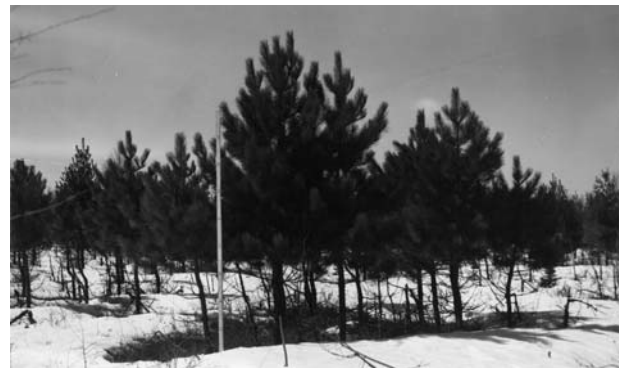
Figure 2. "The demarcation between the living foliage and dead branches of all trees in the group forms a straight horizontal line". Page 6 in Pomerleau and Ray (1957).