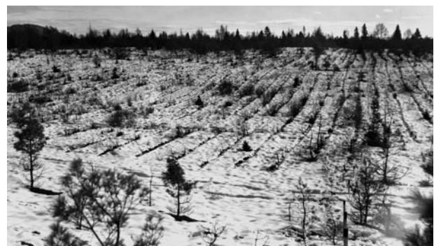
Figure 3. "In a few areas, especially in ground depressions, all the red pine trees were dead." Page 6 in Pomerleau and Ray (1957).